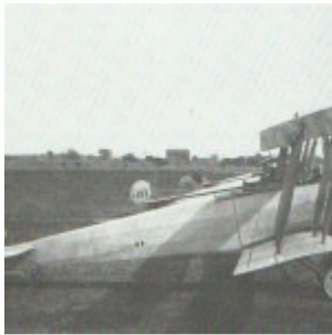
Canadian Avro 504

Resourcefulness and a sense of humour were required by the first AMEs. Their work was hard and at times dangerous. Engines were started by hand-swinging the props. One misstep or a backfire could mean maiming or death. Their tools were hand fabricated in many cases and maintenance manuals were rudimentary or non-existent. They learned from experience and from one another. The onset of World War I and the heavy investment in research changed aviation rapidly. Governments also had to deal with replacing pilots quickly and training masses of mechanics. All of this forced them to adopt structured training and manuals, and the effect of this effort was to last until today.