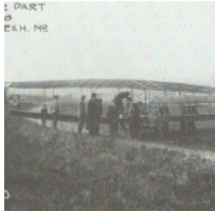
A.E.A Silver Dart – Ground

officer, port and starboard all came from the same marine world. The Americans alone among English speaking nations tended to prefer mechanic, a term that is highly respected in the USA. Why they did so is difficult to understand unless they simply wanted to be different from the British Empire, with whom they had had a falling out.