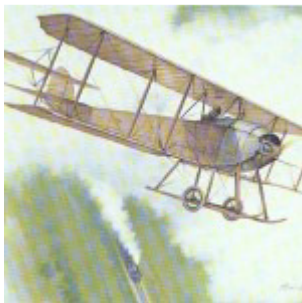
Vought-Lillie tractor biplane